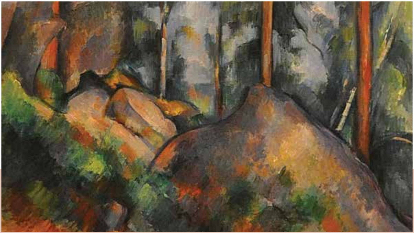
Stephen Sandoval/Museum of Modern Art, New York City, Lillie P. Bliss Collection

As I moved closer, it tightened its grip. The boulders in the foreground were dark at the edges, light where the sun peeped through. The upper branches broke free and became little dabs of paint, applied in rhythmic strokes. Paint became tree; tree became paint. I knew nothing about painting, zilch about art history, but the crazy energy coming off that canvas felt like it was addressing some puzzle l already had in my head. I couldn't stop looking. I barely moved. My dad, who had turned around wondering where I'd gone, found me standing a few feet from the image, and when he came up behind me, without turning around, I asked him, "What is this?" And he, without looking for a label, answered, "This ... (and it was the first time I ever heard the name) ... is a Cezanne."